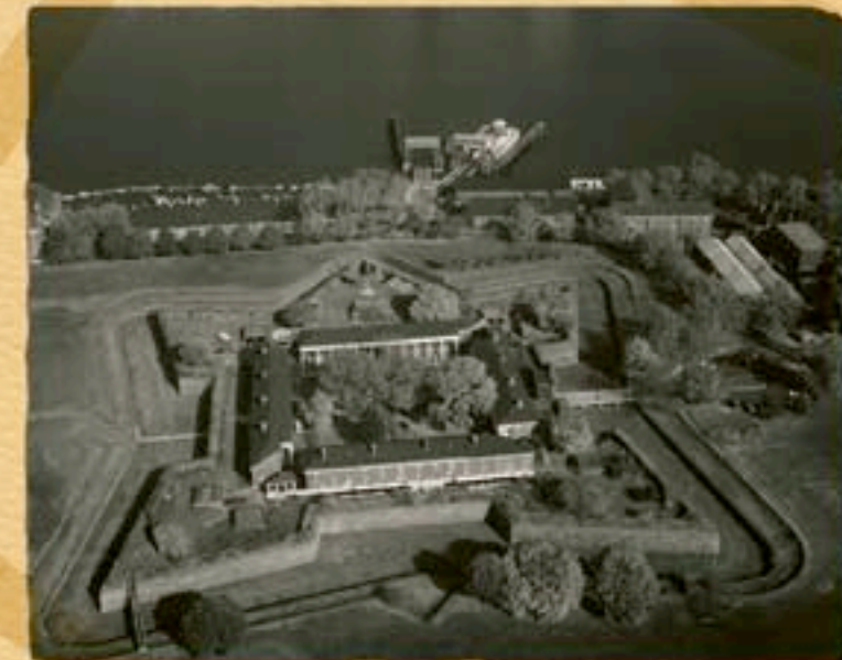
5 Fort Jay Begun in 1794, star-shaped Fort Jay is surrounded by earthen walls and dry moats.