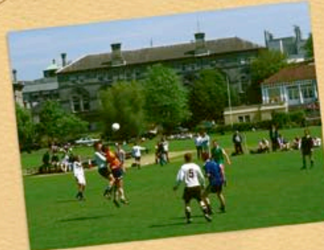
4 A Park? Governors Island could offer parks and open space to city residents.