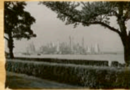
8 The island offers spectacular views of the harbor and lower Manhattan.