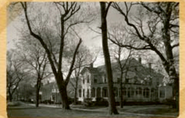
6 Nolan Park has been home to the families of Army and Coast Guard officers for generations.