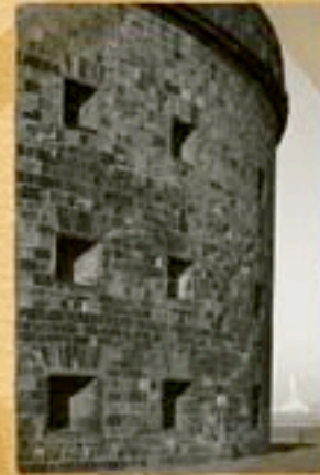
1 Castle Williams The unique 1811 fort is now part of Governors Island National Monument.