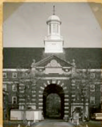
2 Liggett Hall Originally the barracks for an entire regiment, it was designed by McKim, Mead and White.