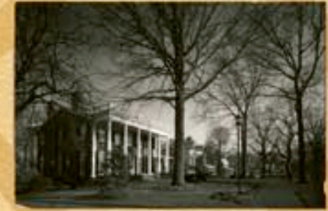
7 The Admiral's House is a City and National Landmark.