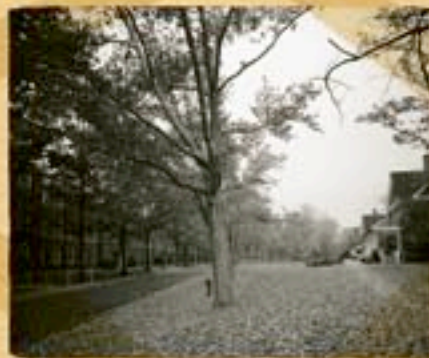
3 Colonel's Row Just one of a series of landscaped spaces on the island.